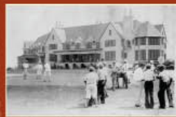
Mount Plymouth Hotel 1920's

The waterways of East Lake County provide limitless opportunities for recreation.